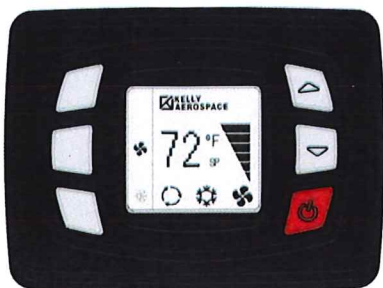
CB-2 Climate Controller