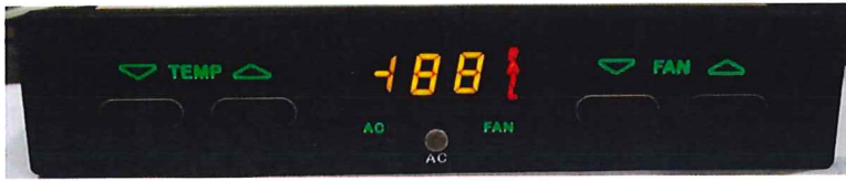
A1235 Climate Controller